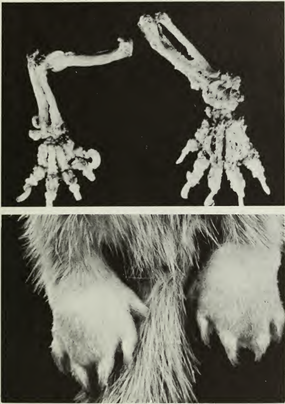
Fig. 9. Osteoarthropathy — top , bony deposits on feet; bottom , swollen hind feet.